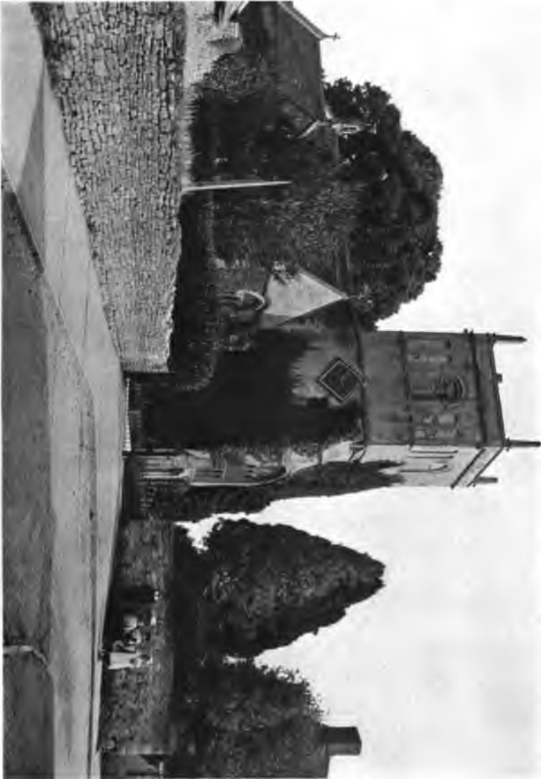
THE CHURCH OF ST. GREGORY, AT BROCKINGTON, CO. SOMERSET, ENGLAND